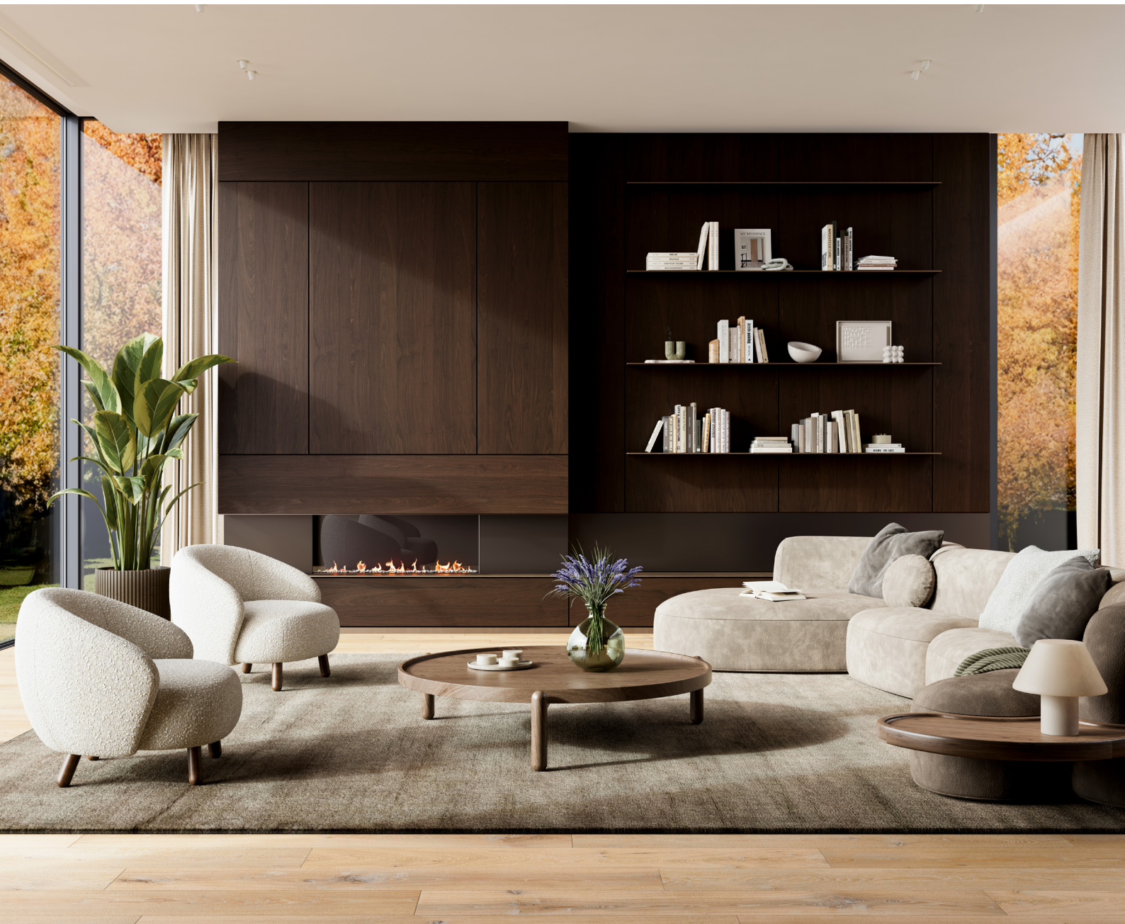
Finish: transparent varnish