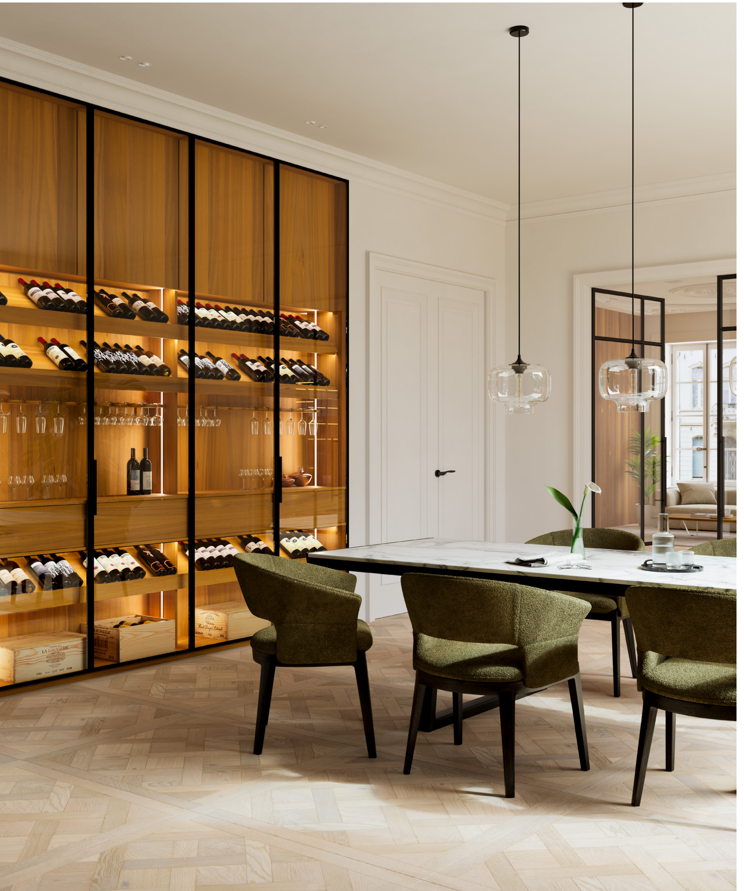
Finish: transparent varnish