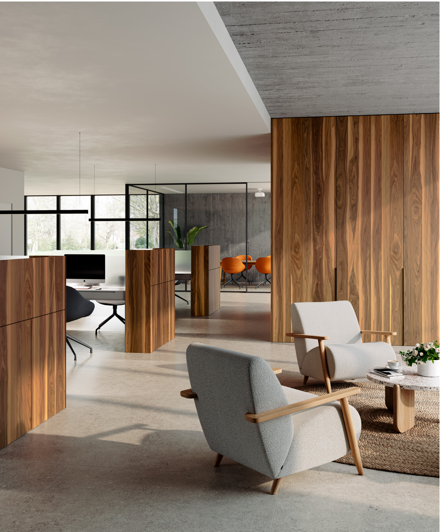
Finish: transparent varnish