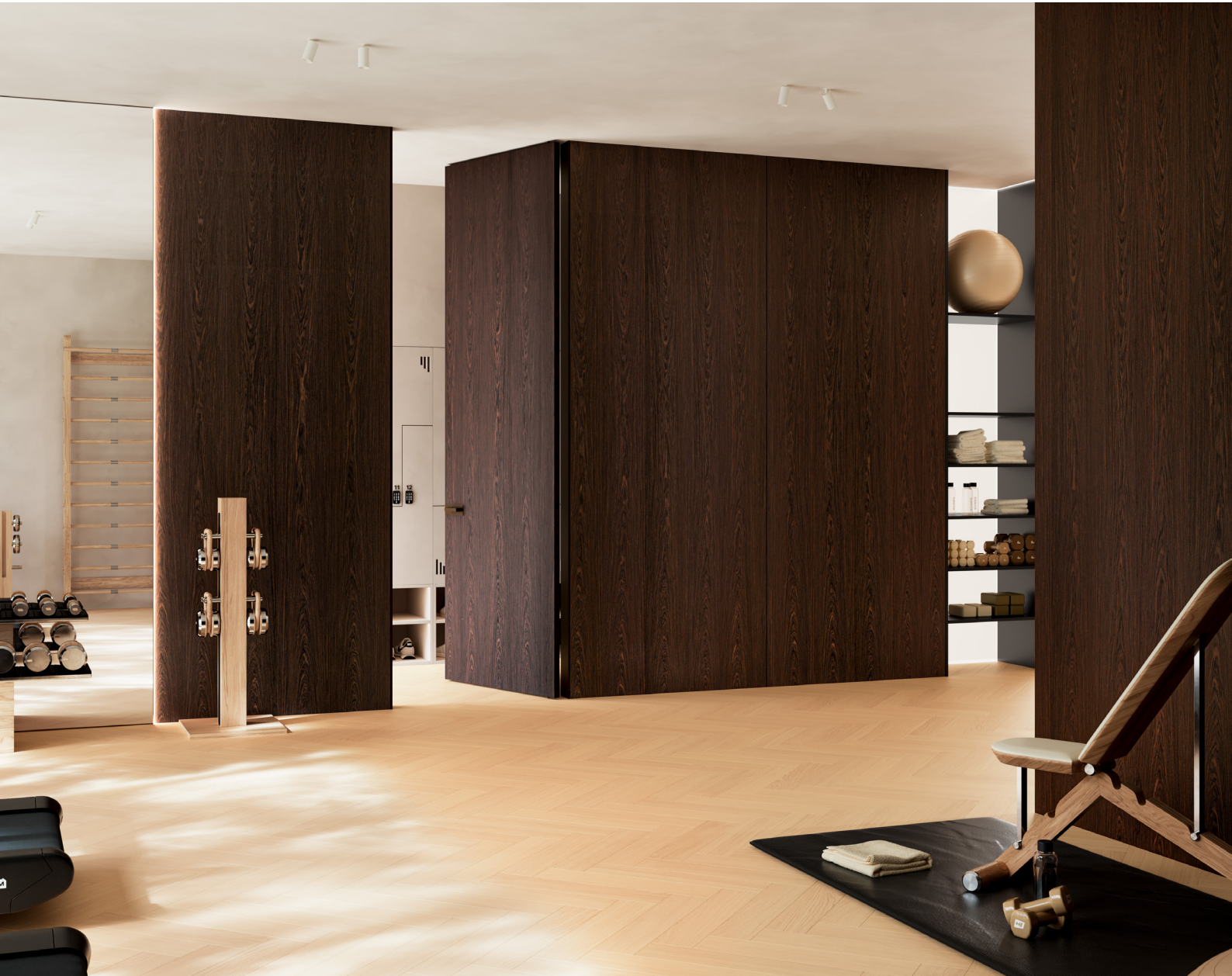
Finish: transparent varnish