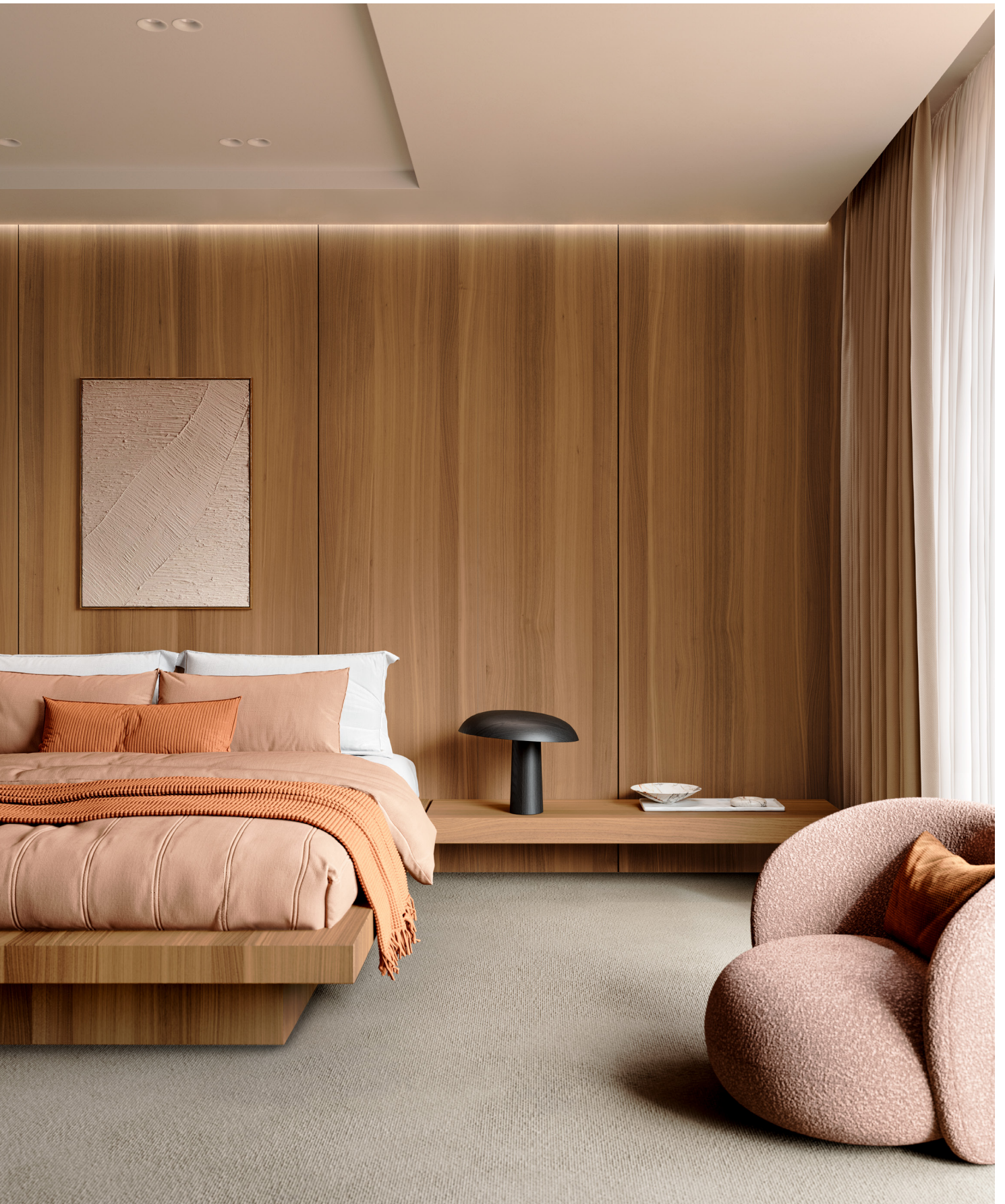
Finish: transparent varnish