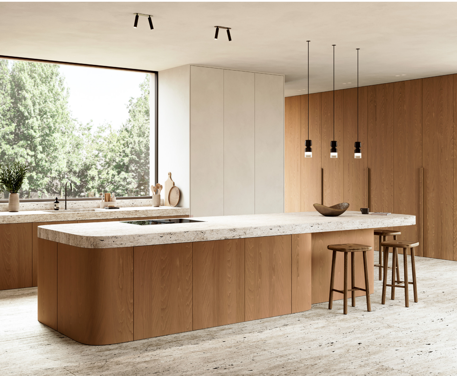
Finish: transparent varnish