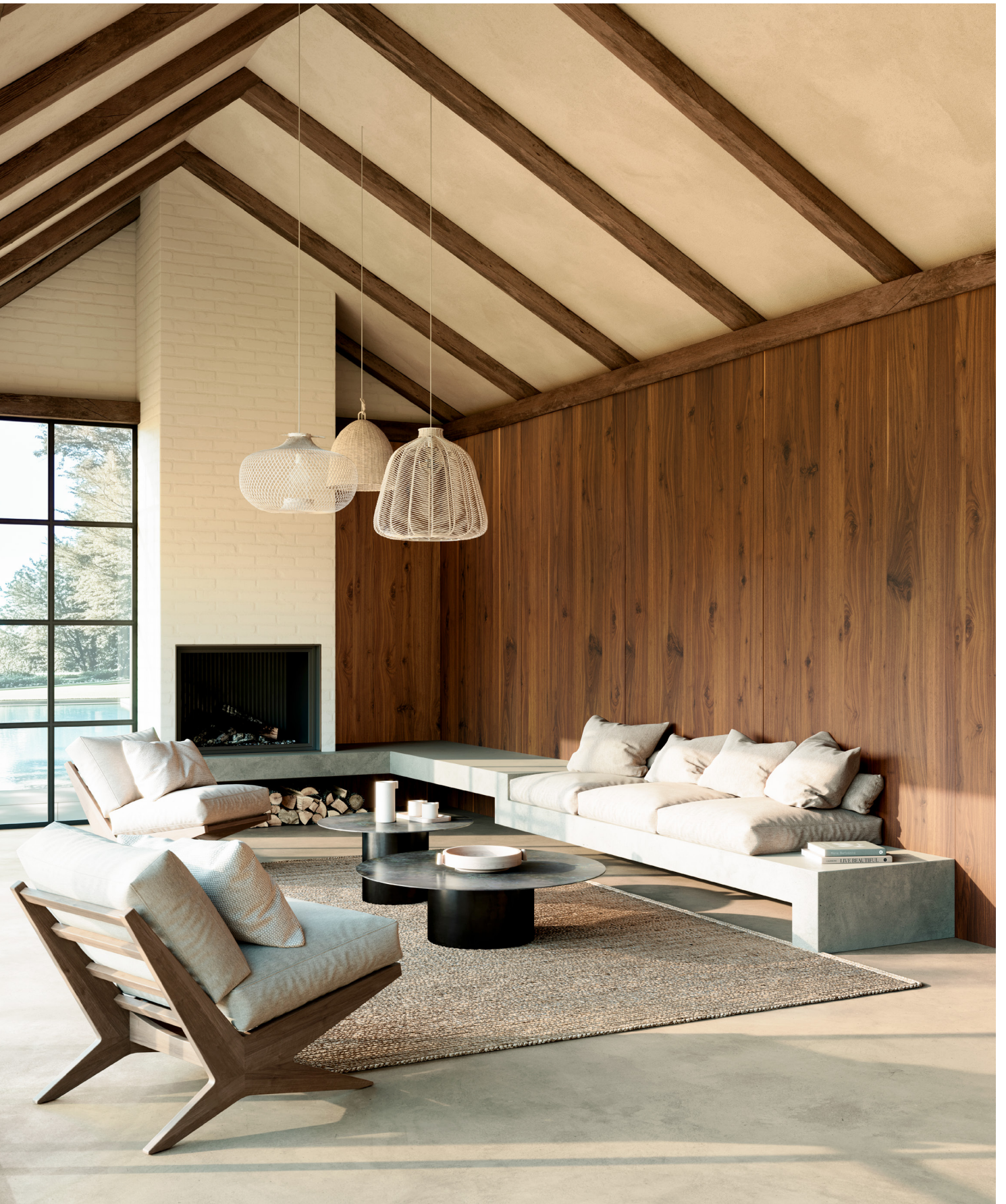
Finish: transparent varnish