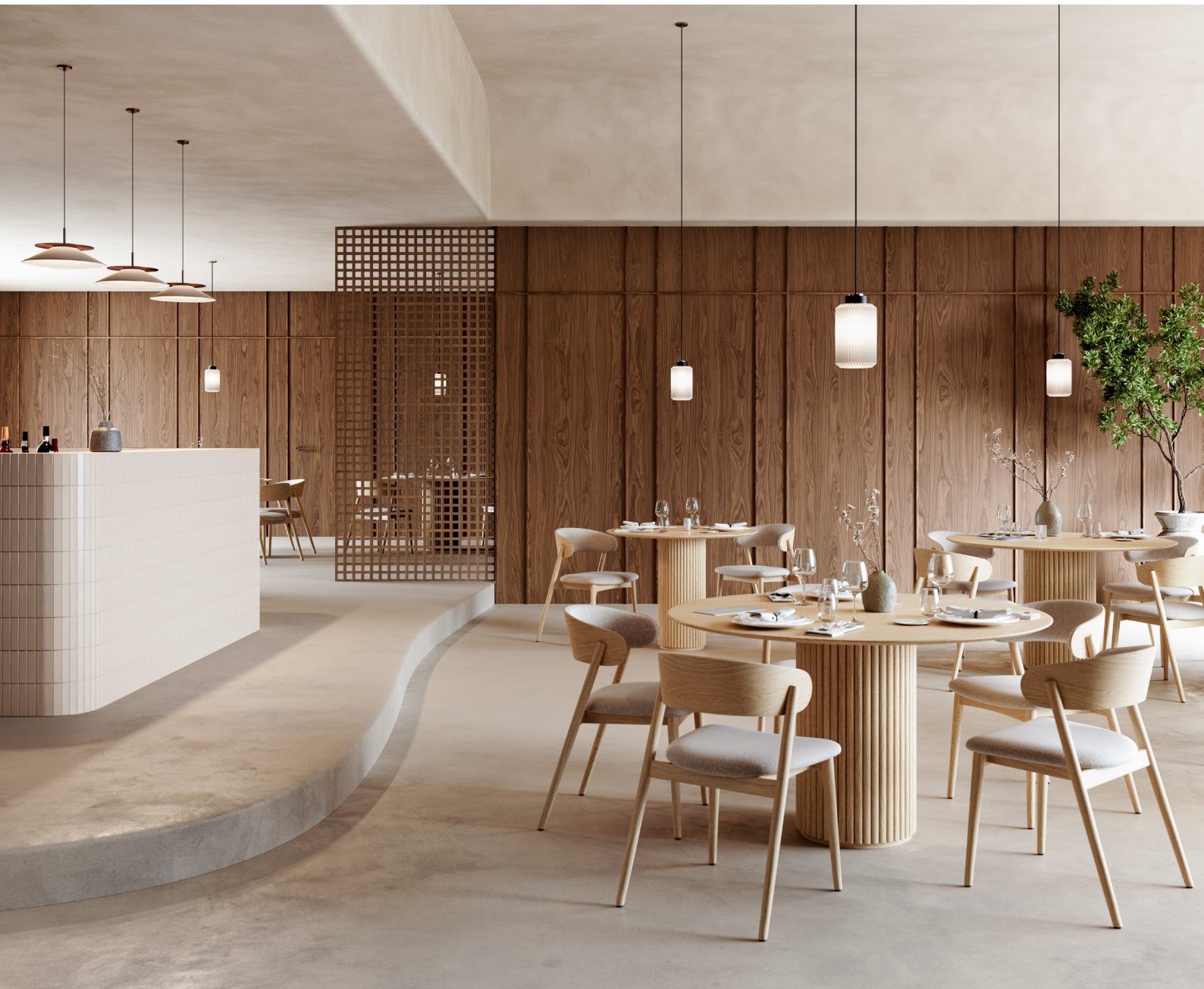
Finish: transparent varnish