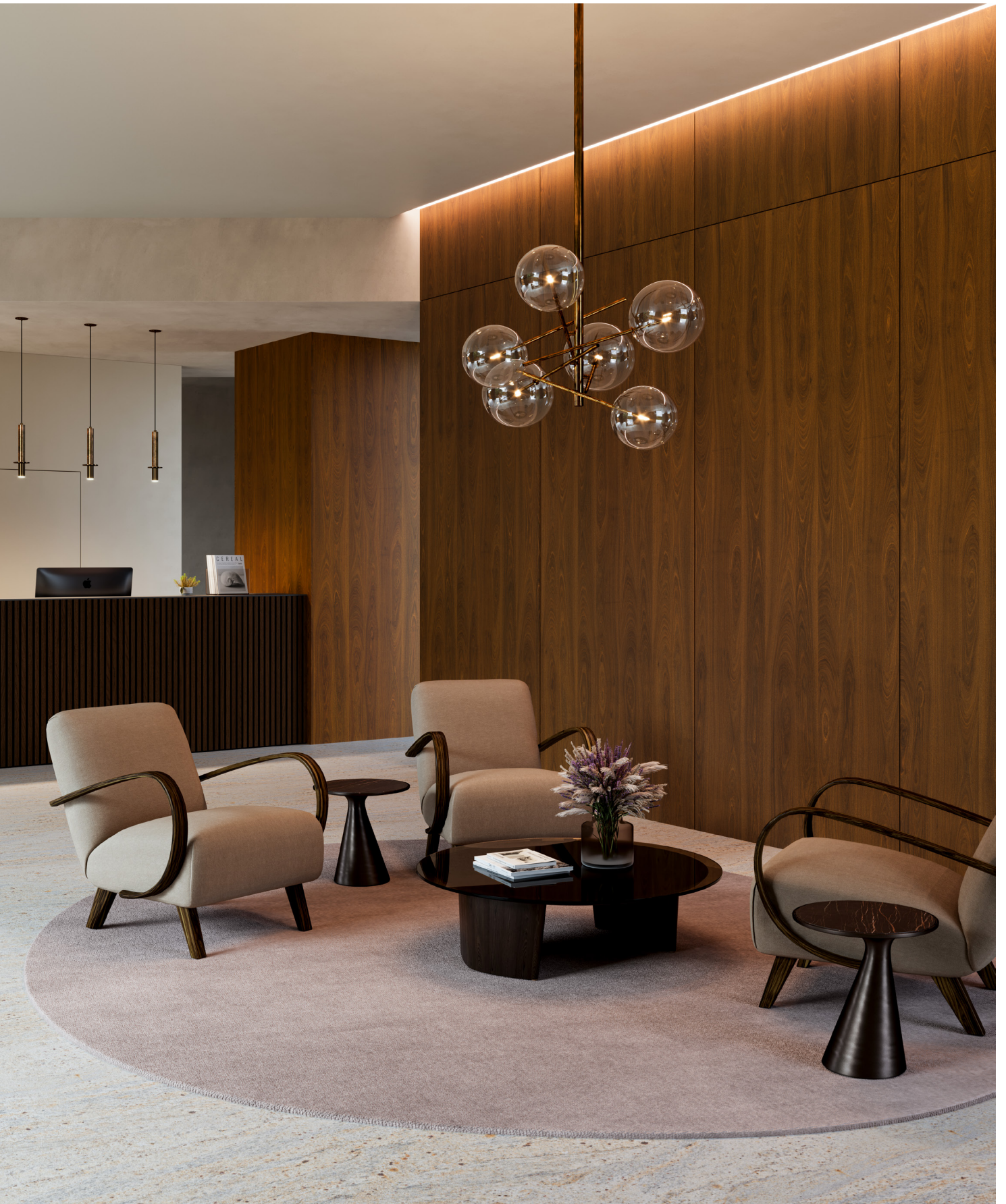
Finish: transparent varnish